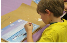
Copying a Monet!