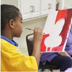
Copying a Matisse!